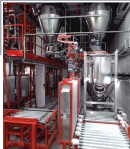
Container filling with KAD – KOKEISL