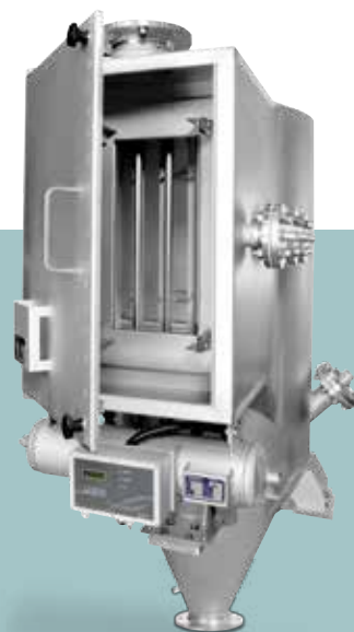
Dust collector with two-step filtration